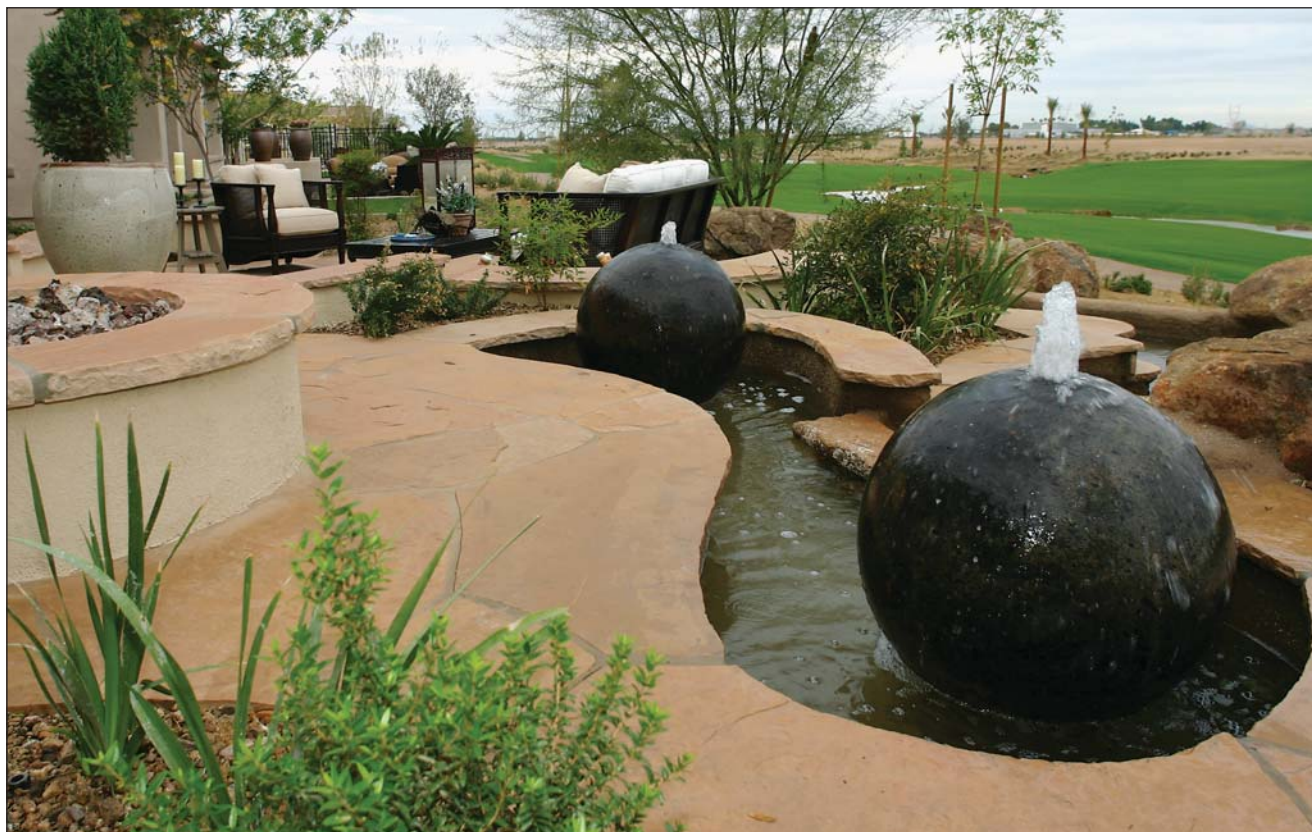
The unique combination of contemporary shapes and natural materials creates a fresh look outdoors.

"We have taken many landscapes and courtyards that people walked past for years without even the slightest hesitation or observation, and created the most basic of water features," says Chafey. "We created not only a visual trap, but a destination. An entry courtyard that was never used becomes the